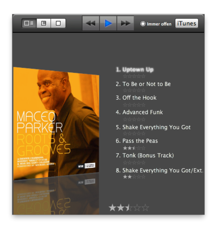
Track & Album rating in the perspective appearance